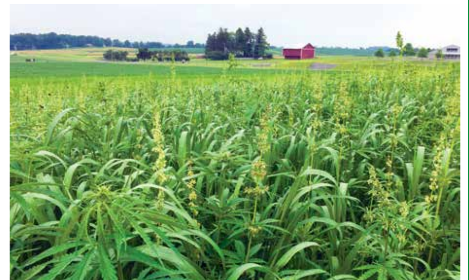
Hemp fields like this may find their way back, in the future, to Susquehanna County.

With changing legal status regarding the crop and renewed interest by producers, economic opportunity may develop for some local growers. Hemp can be grown for seed/oil, fiber, or cannabidiols (CBDs) extracted from the plant tissue. Industrial hemp is commonly grown specifically for a single end-product use (not unlike a specific tomato cultivar being grown for processing, rather than fresh eating). Hemp genotypes highly productive as a fiber source aren't necessarily the optimum genotype for CBD or oil production. Some dual-purpose genotypes provide for fiber and seed/oil but current cultivars are not likely to excel for either end-product. Labor and production requirements vary widely between end-product produc-