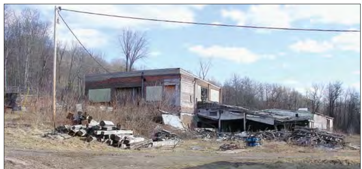
Top photo: The Bern building on Main Street in Towanda destroyed by fire. Bottom photo: Neglected industrial property on Willow Street in Troy.