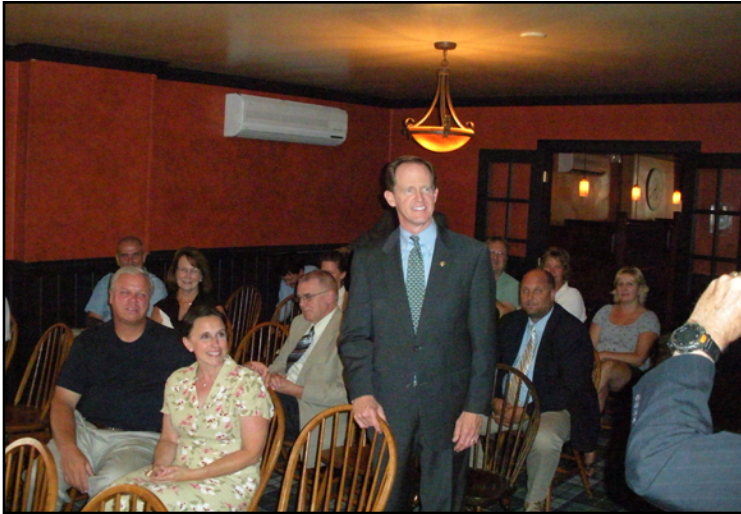
Senator Pat Toomey