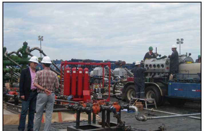
German Delegation Tours Frac Site