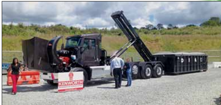
Cabot Ribbon Cutting: Diaz CNG Truck