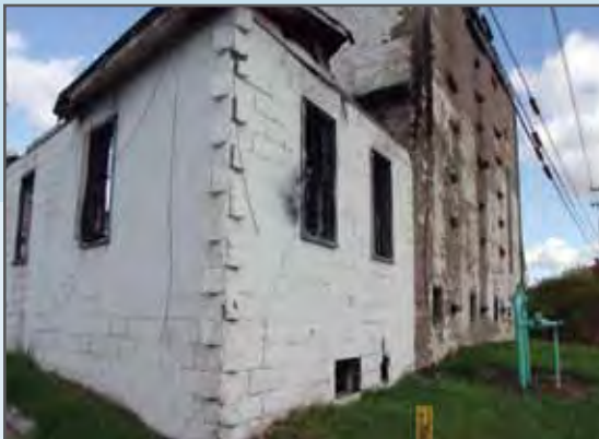
Canton Site before