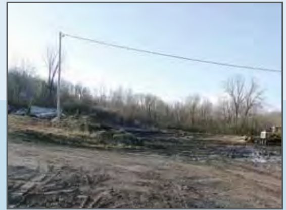
Troy Site after