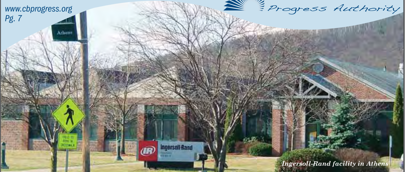
Ingersoll-Rand facility in Athens