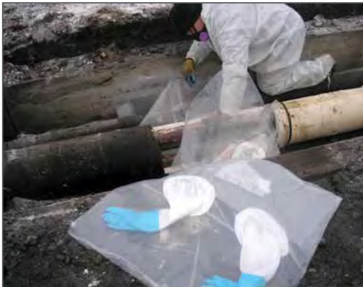
Remediation of Asbestos-Containing Piping Materials