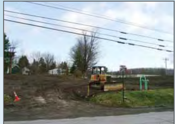
Canton Site after