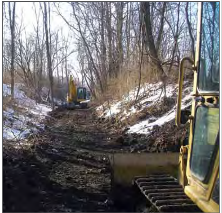
Contractors Install a Soil Cap on a Portion of the Site

All activities are completed with the exception of ongoing recovery efforts for the petroleum on the groundwater. With the majority of environmental concerns addressed, the Progress Authority is now attempting to move forward with redevelopment efforts at the site. Pennsylvania DEP has been heavily involved and very supportive throughout this project.