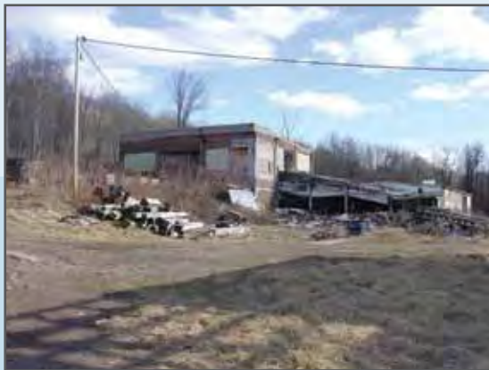
Troy Site before

The Progress Authority, in cooperation with the Western Bradford Development Corporation, will now focus on marketing these properties for commercial/industrial development opportunities.