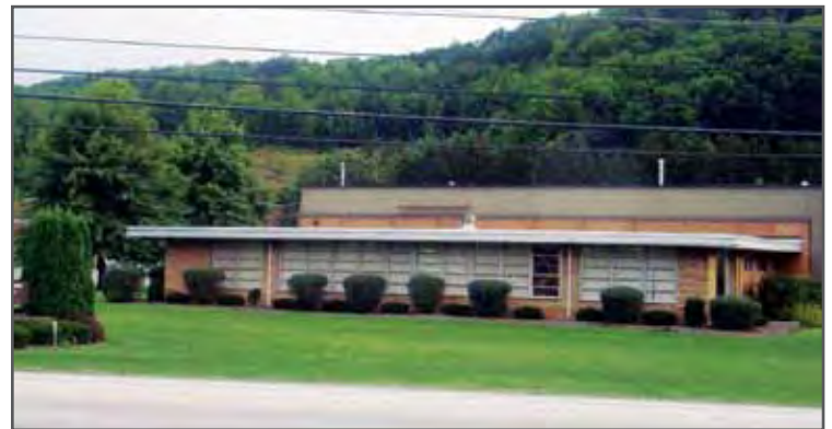
Parker Hannifin Facility in Canton

Another victim of the poor economy was Parker Hannifin in Canton, which closed and displaced approximately 55 workers. Ingersoll-Rand in Athens has also announced that its plant will close by the end of 2010, impacting approximately 200 employees. In addition to industrial job losses, many retail businesses in Bradford County had challenging years as well.