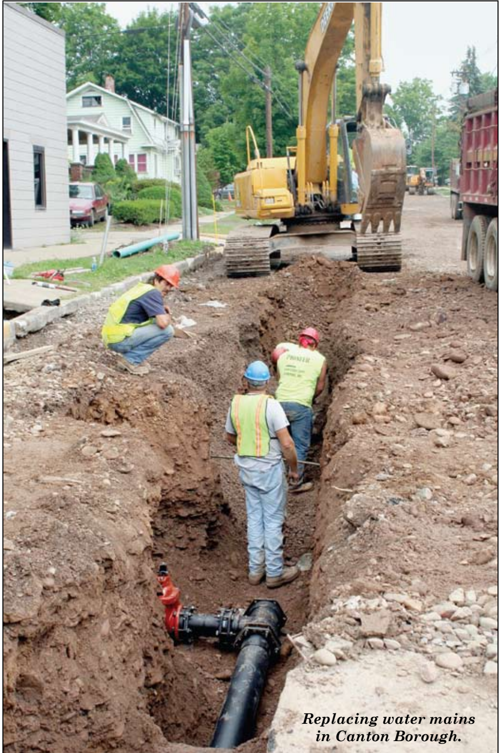
Replacing water mains in Canton Borough.

Financing for this project was provided by First Citizens National Bank, PennVest, USDA's Rural Utilities Service, the Community Development Block Grant Program, and an Appalachian Regional Commission grant sponsored by Northern Tier Regional Planning & Development Commission and the CBPA.