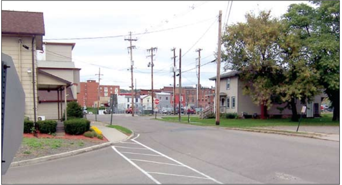
Existing Yanuzzi Drive/Fulton Street, to be re-designed.

Drive in front of the Lepirino Manufacturing facility.