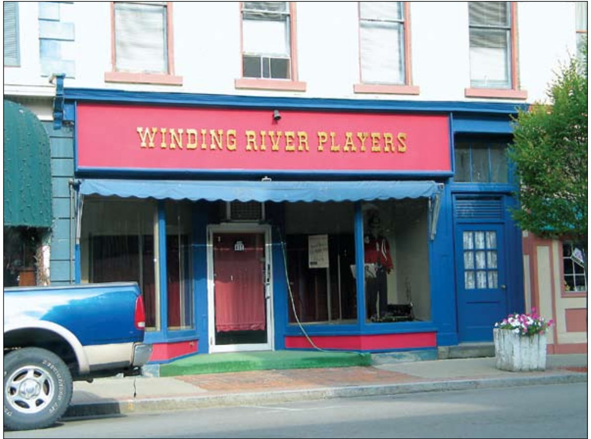
Photo at right: Building at 415 Main Street in Towanda, purchased by the Winding River Players for their headquarters.

The CBPA is excited to assist the Winding Rivers Players in their continued support to promote theatre arts for people of our area.