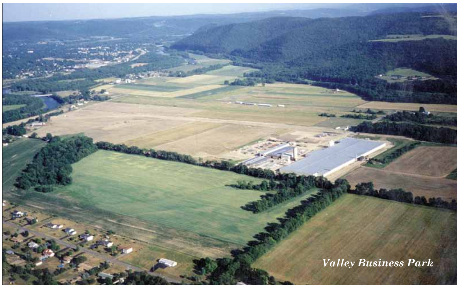
Valley Business Park

Road C, when constructed, will greatly enhance highway access to Valley Business Park and make it more marketable to potential industrial employers. The improved access will benefit Mill's Pride as well as future tenants of the park. Previous efforts have led to municipal sewer, water, electric, natural gas, telecommunications infrastructure, and a Keystone Opportunity Zone designation at Valley Business Park. The CBPA recognizes the importance of Road C as the final piece of infrastructure needed to enhance Valley Business Park.