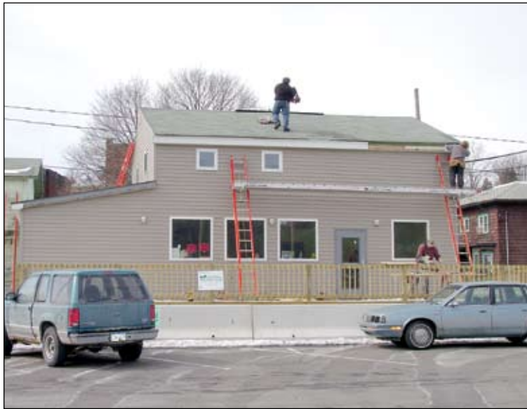
Renovation of a building at 7 State Street in Towanda is currently underway, soon to open its doors as the Table Rock Meat Market & Deli.

The CBPA was able to participate with Citizens & Northern Bank to make his business plan a reality. The project solidifies the secondary business district concept as a benefit of the River Street extension as providing greater access and visibility to the properties in the corridor. The project is on target for a March/April 2006 completion.