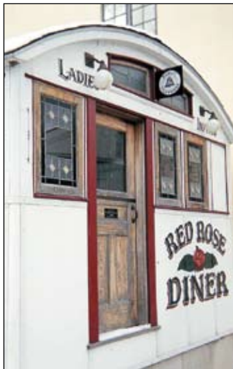
The Red Rose Diner is located on Main Street in Towanda.

The diner experience is a trip back in time. This unique project is a fine example of working together to benefit all of the entities involved.