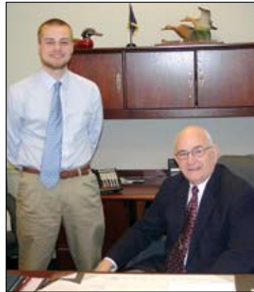
CBPA's Brian Driscoll with Senator Roger Madigan.

Senator Roger Madigan and the CBPA were able to work together to initialize legislation to utilize the Governor's Capital Budget as a financing component for key projects. Some of the Bradford County projects for which the CBPA hopes to access this funding in 2006 include: