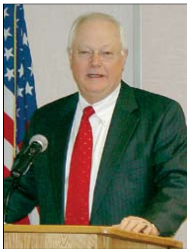
Congressman Don Sherwood

Susquehanna County Commissioners and representatives of Lackawanna College recently met in Montrose for exploratory discussions on forming a new satellite center for college and continuing education programs in the region. Lackawanna College, a private two-year college, offers a variety of associate degree and certificate programs. The college's main campus is in Scranton, with additional centers in Towanda, Honesdale and Hazleton.